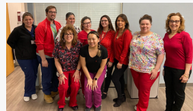
Woburn Medical Associates - Wilmington