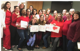
Winchester Family Physicians